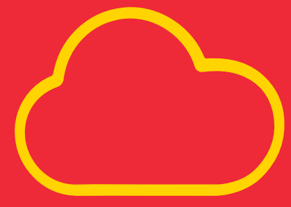
Colocation & Cloud

Vodafone Idea Limited 2020 ©. This document may contain such as text, graphics, images and other material is created / issued by Vodafone Idea Limited or obtained in confidence (“Content”) and are for informational purpose only. The content is not to be reproduced for commercial use or for any otherwise purpose in whole or in part, without the prior written permission of Vodafone Idea Limited. ‘Vodafone’ and ‘Idea’ are trademarks of the Vodafone Plc and Idea Cellular Limited renamed as Vodafone Idea Limited, respectively. Any products or services provided by Vodafone Idea Limited under the Trade Mark, Vi, its motion, logo, trade dress, static or moving depictions with each and every element thereof, is protected under existing trademark, copyright and all intellectual property rights available under law and are owned by Vodafone Idea Limited. The content contained in this publication is correct at the time of going to print and was derived from events/action taken by Vodafone Idea Limited. Such content may be subject to change, and services may be modified, supplemented or withdrawn by Vodafone Idea Limited without prior notice. All services are subject to terms and conditions, copies of which may be obtained on request.